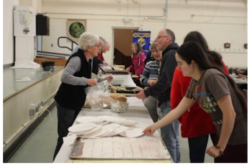
Coats for Kids Spaghetti Supper Pictures